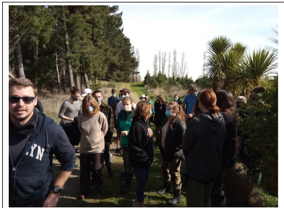
Bottom: UC Water ecology students