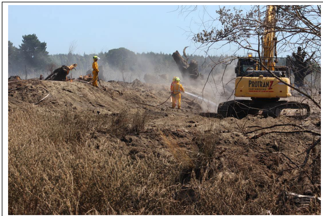
Left: Fire crews extinguish hotspots at the Pines Wetland fire site

This year we liaised with Environment Canterbury to get Tūtaepatu Lagoon water tested. This was a comprehensive test identifying some early stage worrying signs, which were likely related to the very low water levels during the summer and monitoring period.