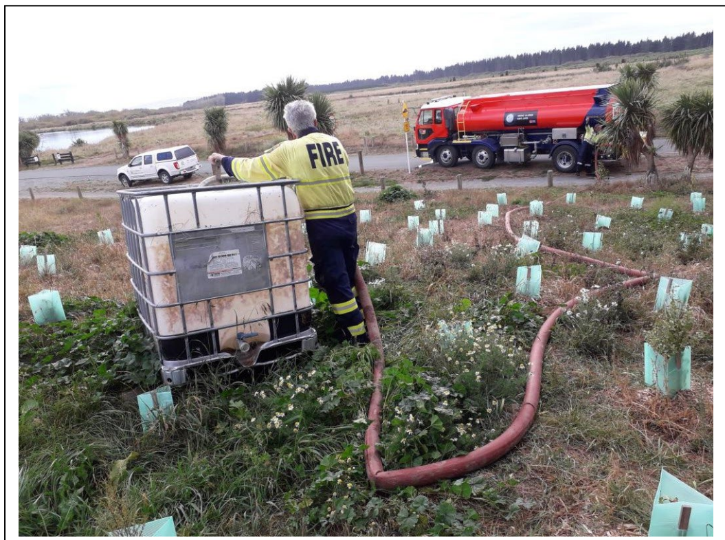
Bottom: Woodend Fire helped during the drought by filling our water tanks