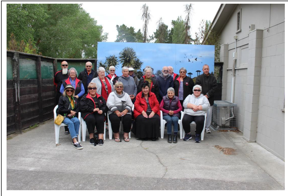
Above: Tuahiwi Kaumatua visit