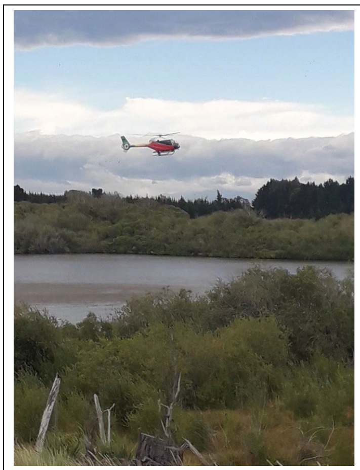
Below: ECan take water samples from Tūtaepatu Lagoon