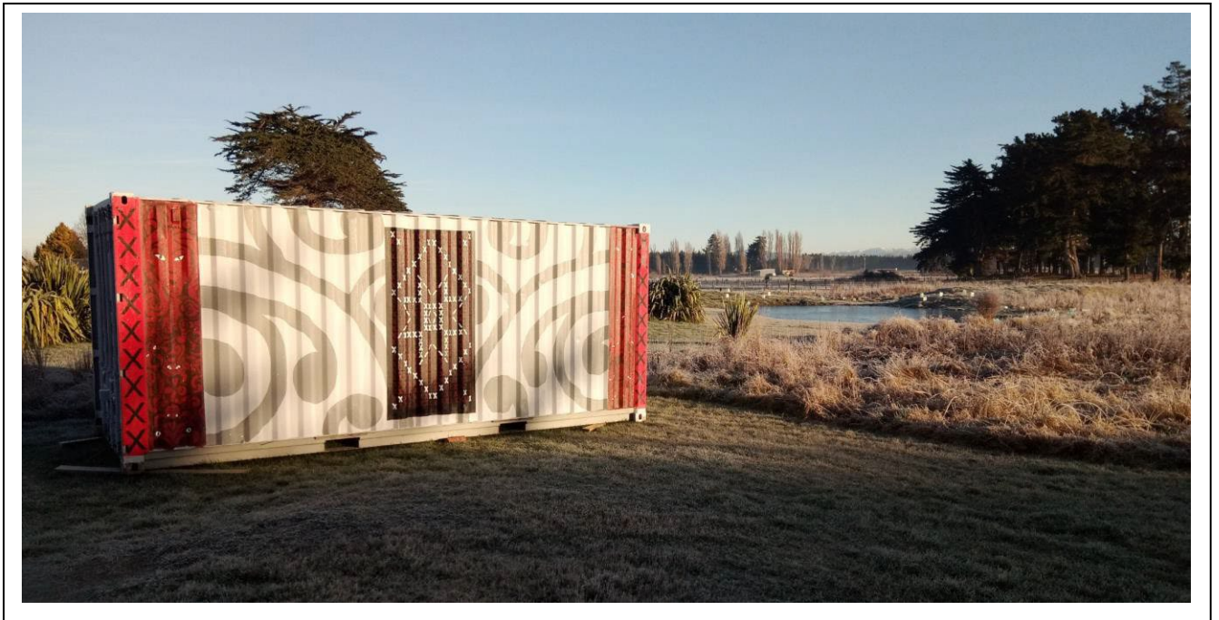
Front cover photo: Pa harakeke container mural