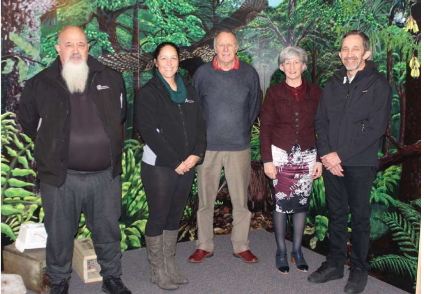
Trustees: (left to right)

Attendance: 12 meetings including Zoom during Covid lockdown