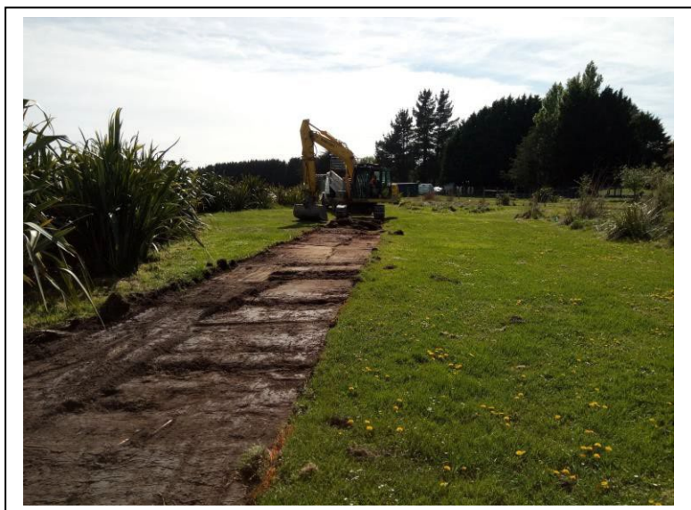
Bottom: Trail upgrade Tūtaepatu Trail