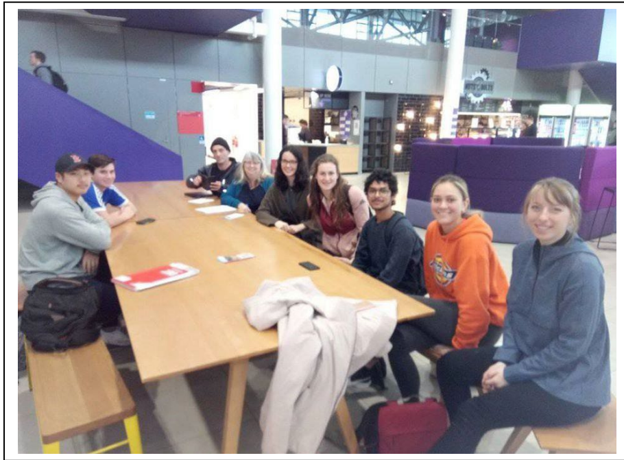
Left: UC Geo 309 students.

We also began a project with UC to coordinate Learning Experiences using the Tūhaitara Coastal parks wonderful resource, history, features and geography. This program is being designed to use the resources to introduce students from low decile schools to pathways to study in STEAM and tertiary study including UC and Ara.