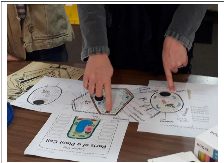
Middle: Plant cell lessons at Te Tai Kōhaka