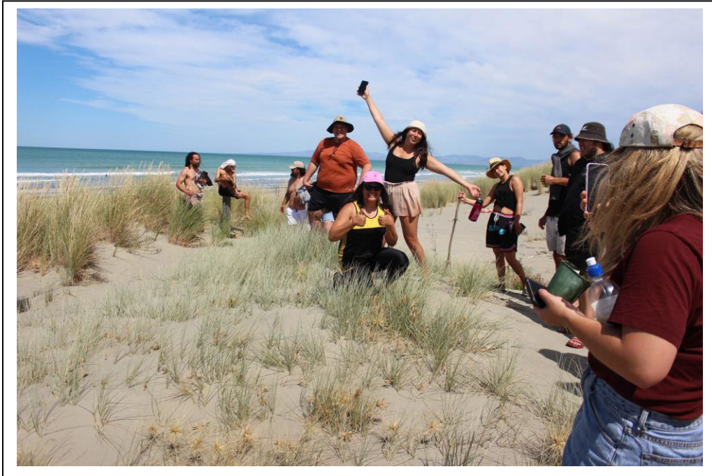
Left: Rangatahi visit