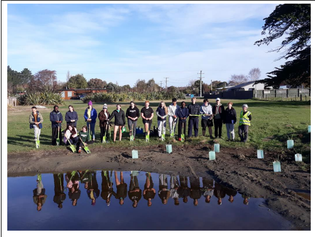
Left: Middleton Grange students complete the first planting in their Biota Node

We have planted approximately 7500 native trees and shrubs during the reporting period at Achilles Parade, Tiritirimoana Drive, Pines Beach Wetland and the Tūtaepatu Transect.